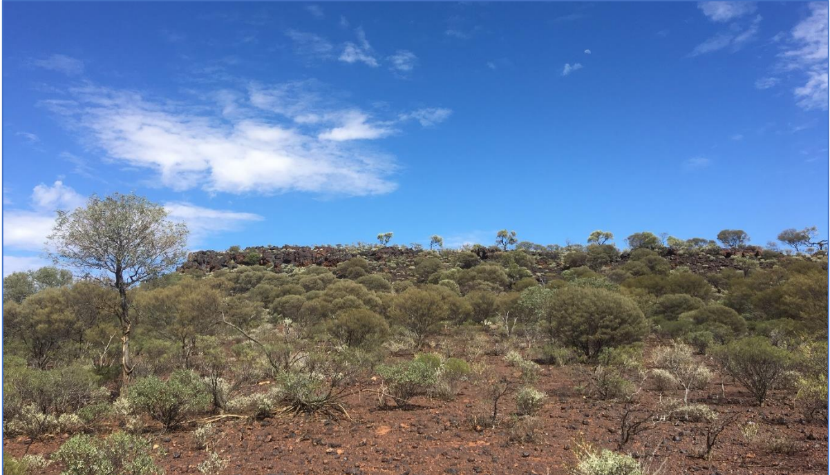
Plate 1 – View of Manganese capped mesa at Black Hill looking West