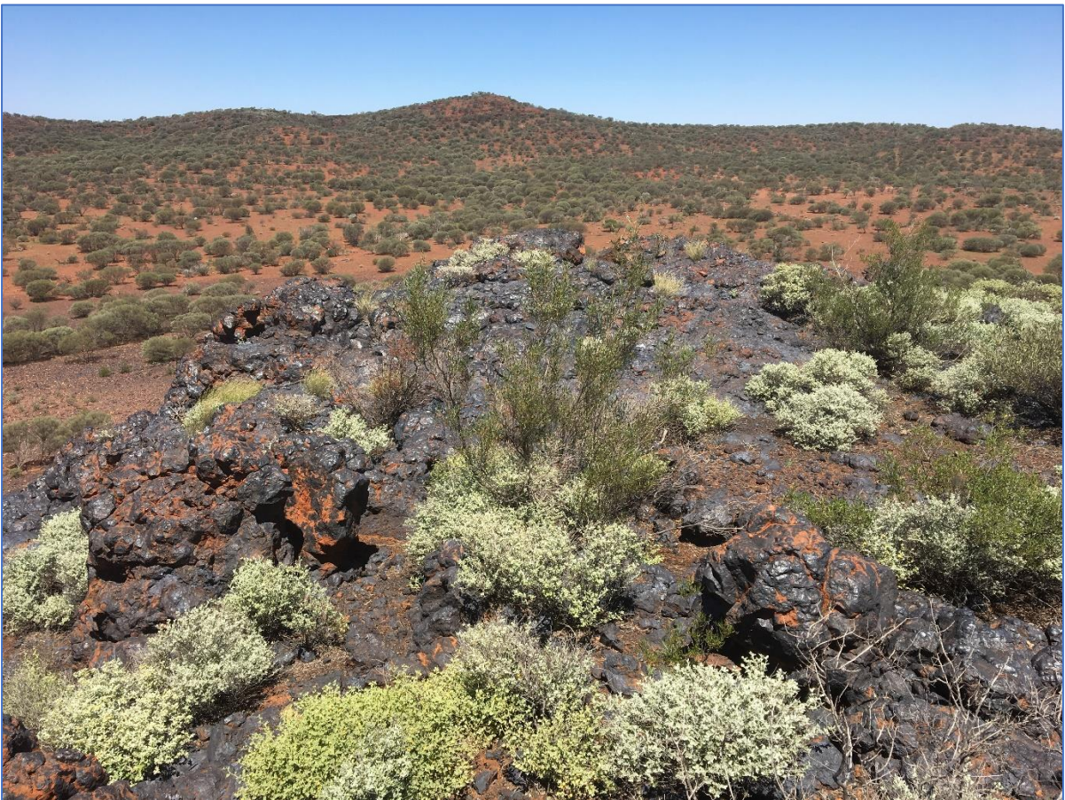
Plate 2 – Top of the Black Hill mesa shown in Plate 1 (looking south towards sample BRYRK100 location)